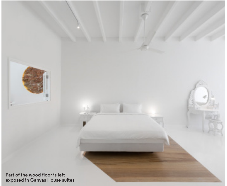
Part of the wood floor is left exposed in Canvas House suites