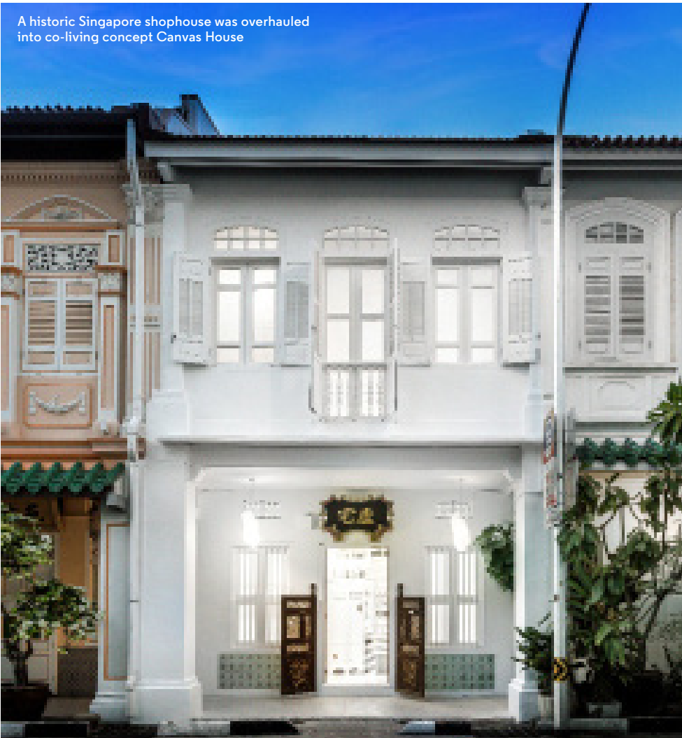
A historic Singapore shophouse was overhauled into co-living concept Canvas House

"Figment is doing something innovative with its boutique co-living concept," he says. "We remain committed to curating homes that have a sense of place and offer a refreshing take on city living that celebrates Singapore's local art and built heritage."