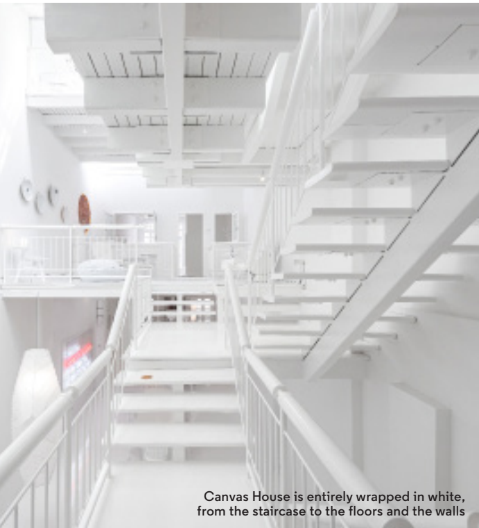
Canvas House is entirely wrapped in white, from the staircase to the floors and the walls